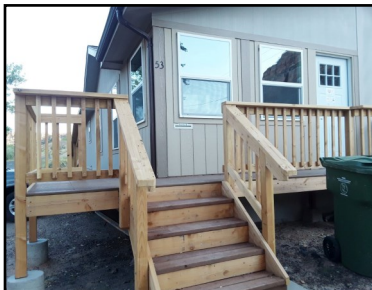
Ramp/Stairs and Reception Area